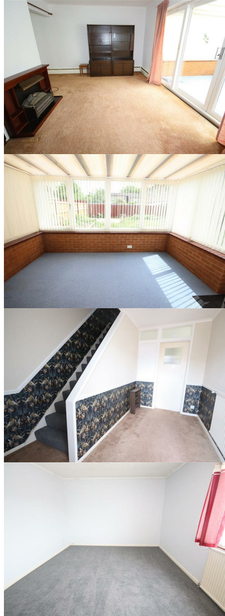
Ground Floor Area: 57.9 m 2 ... 623 ft 2

These particulars, whilst believed to be accurate are set out as a general outline only for guidance and do not constitute any part of an offer or contract. Intending tenants should not rely on them as statements of representation of fact, but must satisfy themselves by inspection or otherwise as to their accuracy. No person in this firm's employment has the authority to make or give any representation or warranty in respect of the property.